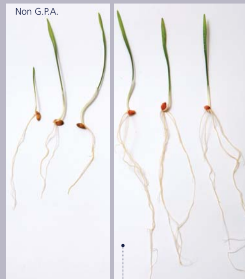
Laboratory tests showing the effects of G.P.A. on root biomass and development