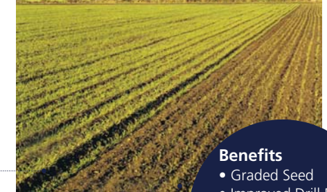
Sowing Nickerson ORIGINAL gives quick, even crop establishment